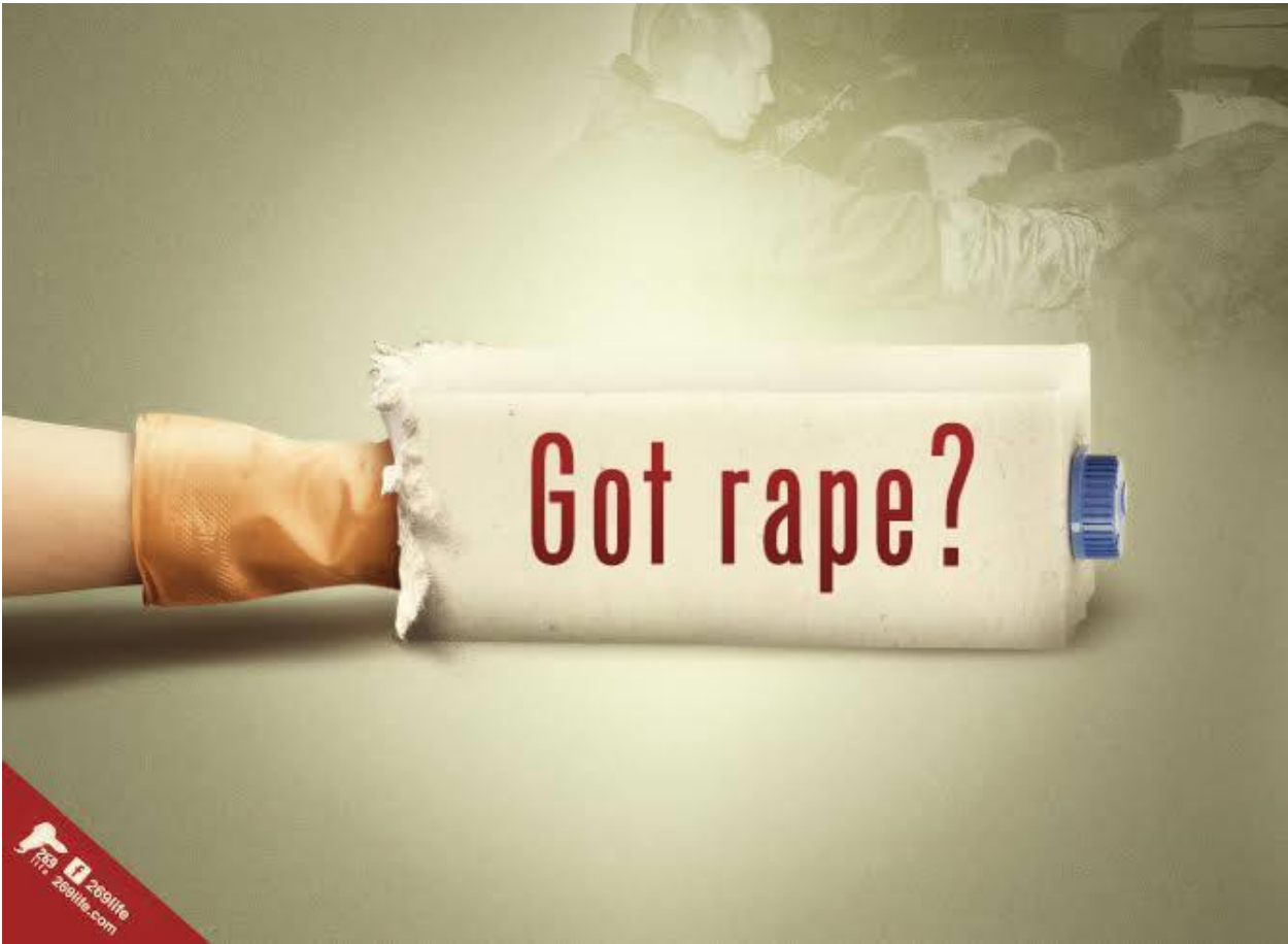
Figure 2. Animal rights campaigning depicting the sexual assault of Nonhuman Animals