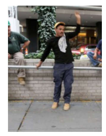
Of course some women are flattered