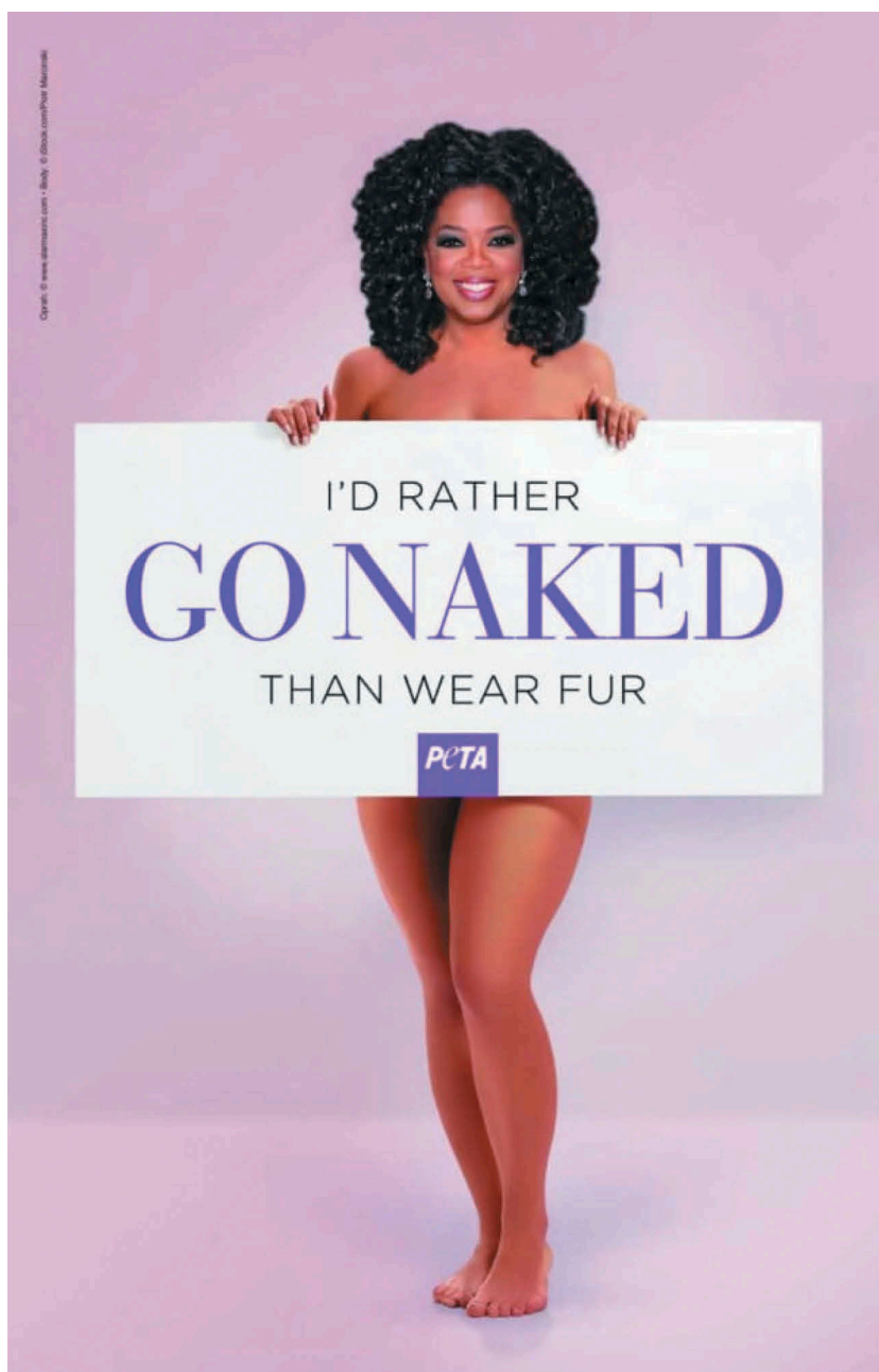
Figure 2. Oprah's spoof PETA campaign.

American participants over the age of 50 who identify as vegan women. This approach was employed under the assumption that those who occupy the marginalized but little understood spaces we seek to illuminate are best positioned to supply rich data in this otherwise undeveloped subject area. Because the parameters of “old age,” are, of course socially constructed, we