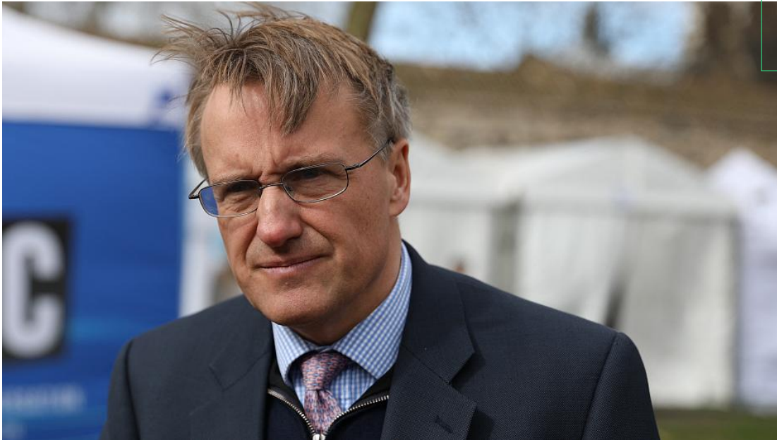
Sir Charles Walker, conservative MP in the UK