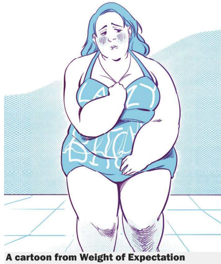
A cartoon from Weight of Expectation

on the BBC's website, and a dialogue with the charity.